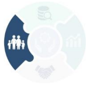
Figure 4: Examples of financial risk layering in support of shock response